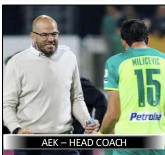
AEK – HEAD COACH