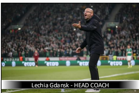
Lechia Gdansk - HEAD COACH