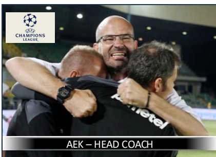
AEK – HEAD COACH